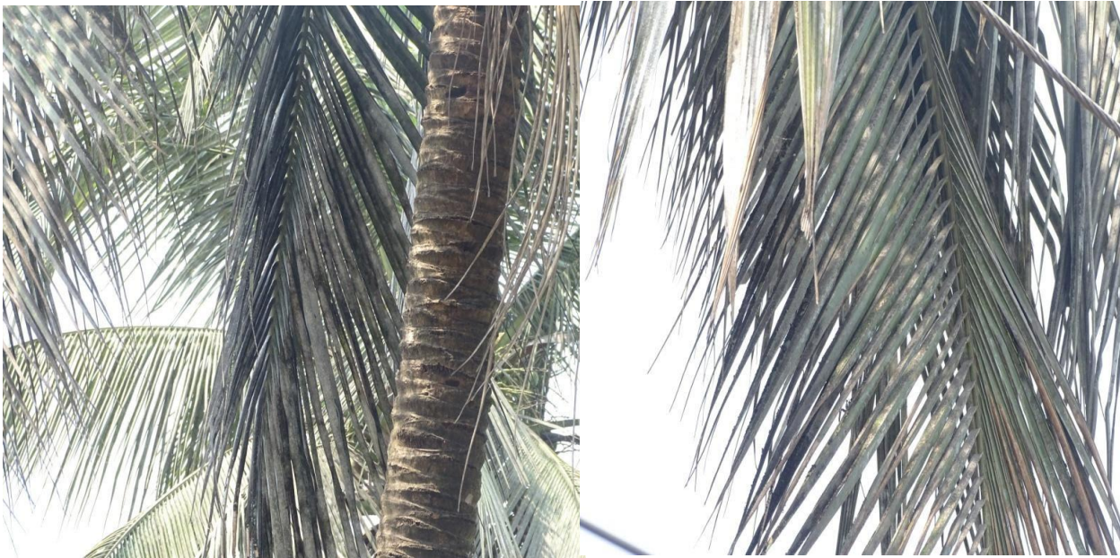
Infestation of RSW on coconut

Insects: Moderate RSW incidence was recorded