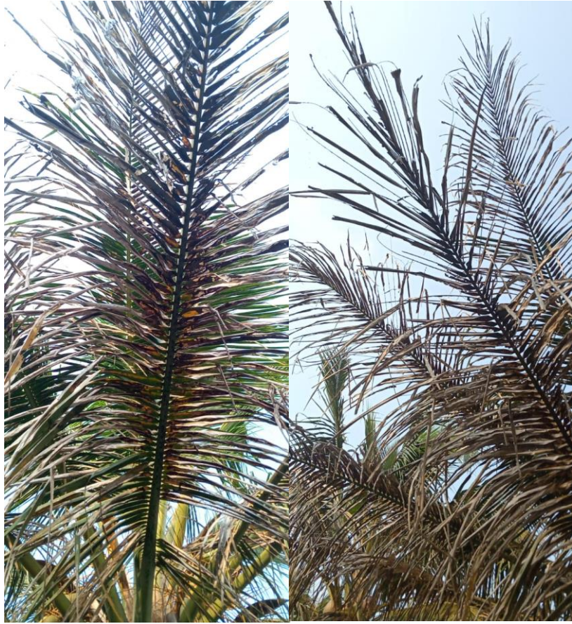
Black headed caterpillar damage in coconut leaves