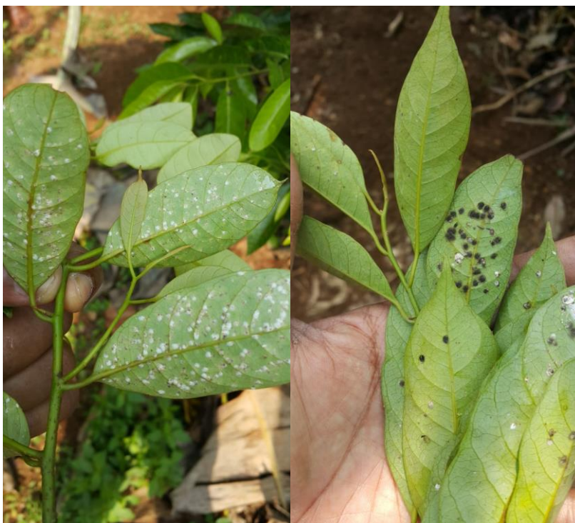
Scale insect infestation in nutmeg leaves